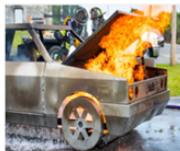
Car Fire & Auto Ex Demos