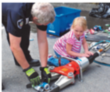
Hands on Demos