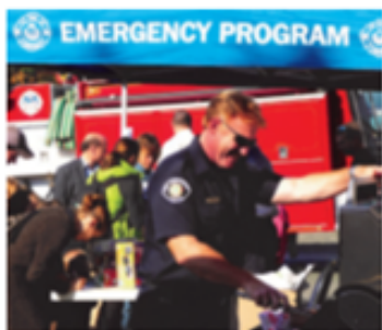
Food & Drinks